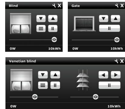
Fig. 3 Roller Shutter icons in Home Center interface

After choosing one of the above operating modes, device will be represented in Home Center 2 interface by icons shown in Fig.4. In addition, each operating mode affects certain parameters settings: Roller blind without positioning (parameter 10 set to 0) Roller blind with positioning (parameter 10 set to 1) Venetian blind (parameter 10 set to 2; parameter 13, set to 2) Gate without positioning (parameter 10 set to 3; parameter 12 set to 0; parameter 17 set to 0) Gate with positioning (parameter 10 set to 4; parameter 12 set to 0; parameter 17 set to 0)